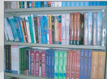
Books purchased with funds from LIMMAT STIFTUNG

The first disbursement of the grant (€ 75,000) was made in February 2006 for the commencement of the project while the second disbursement (€ 75,000) was sent in October 2006. The project aimed to buy about 4000 books at an average price of €48 per book.