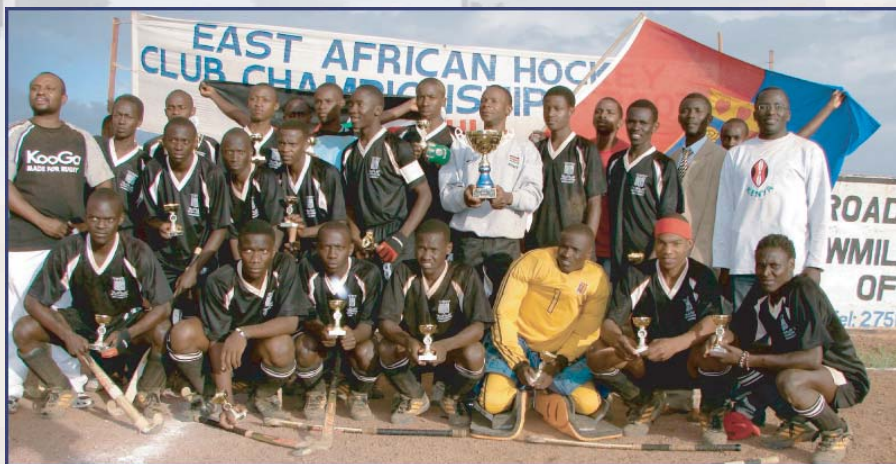
Team photo with the trophy winners sailed through the championship without losing a match and the first time a university side won the championship. It was the first time the Gladiators, who were recently promoted to the Premier league, were participating in an international event. The chief guest at the finals was the District Commissioner for Moshi. The team was partly kitted by East Africa Breweries Limited.

This was the third edition of the games and many tournament records were set. It was the first time the