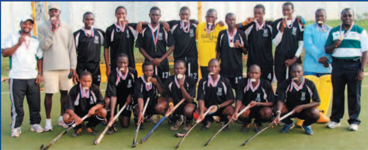
Gladiators, the SU hockey team are the East Africa University Champions. Leos, SU's rugby team are also emerged the regional champions at the East Africa University games held in Kampala from 4th to 7th February