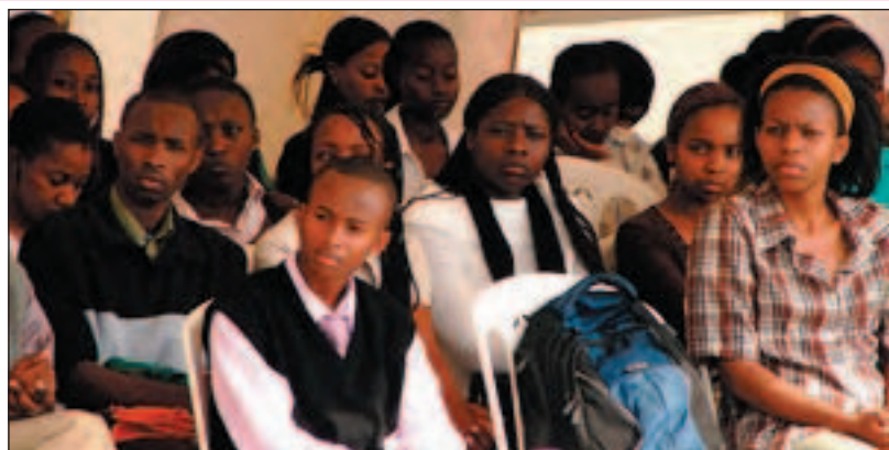
Students following proceedings at the inauguration ceremony