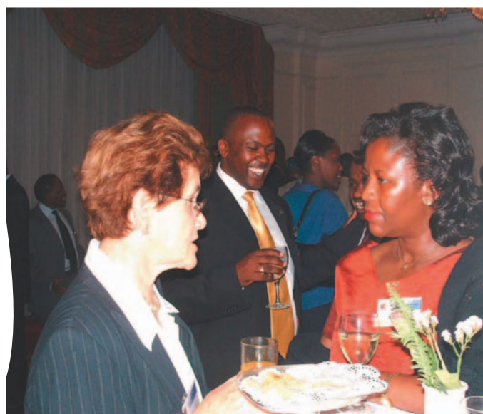
Alumni at a past reunion